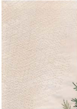
12592-01 Tile 1 5.08 X 7.12 in. 129.03 X 180.85 mm 5,015 St. L

Note: Some designs in this collection may have been created using unique special stitches and/or techniques. To preserve design integrity when rescaling or rotating designs in your software, always rescale or rotate designs using the handles directly on-screen.