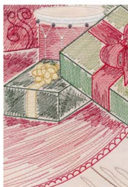
12592-23 Tile 23 4.71 X 6.69 in. 119.63 X 169.93 mm 14,265 St. ⌘ ⊗ L