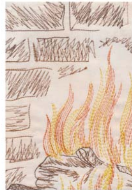
12592-15 Tile 15 4.87 X 6.70 in. 123.70 X 170.18 mm 6,636 St. ⌘ ⊗ L