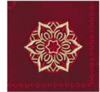
12592-28 Corner 1

3.00 X 6.55 in. 76.20 X 166.37 mm 19,648 St. ⌘ L