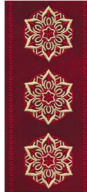
12592-27 Side Borders

4.54 X 3.00 in. 115.32 X 76.20 mm 13,191 St. ⌘