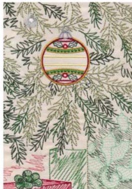
12592-18 Tile 18 4.81 X 6.67 in. 122.17 X 169.42 mm 26,569 St. ⌘ ⊗ L