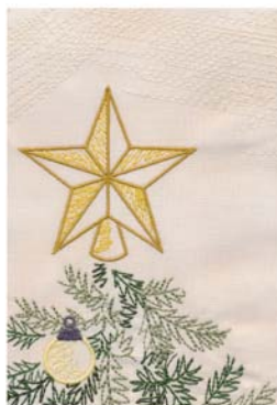
12592-02 Tile 2 5.12 X 6.84 in. 130.05 X 173.74 mm 12,387 St. L