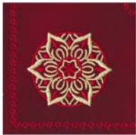
12592-29 Corner 2

3.11 X 3.01 in. 78.99 X 76.45 mm 6,725 St. ⌘