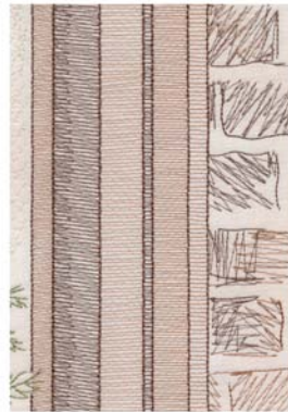
12592-14 Tile 14 4.90 X 6.91 in. 124.46 X 175.51 mm 10,424 St. ⌘ ⊗ L