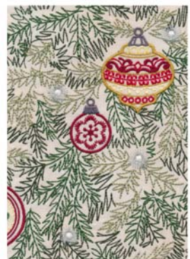
12592-12 Tile 12 4.75 X 6.68 in. 120.65 X 169.67 mm 32,004 St. L