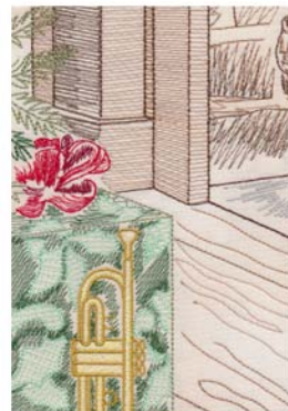
12592-19 Tile 19 4.70 X 6.77 in. 119.38 X 171.96 mm 18,384 St. ⌘ ⊗ L