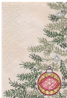
12592-06 Tile 6 4.82 X 6.76 in. 122.43 X 171.70 mm 18,335 St. L