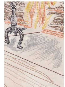
12592-20 Tile 20 4.73 X 6.78 in. 120.14 X 172.21 mm 8,571 St. ⌘ ⊗ L