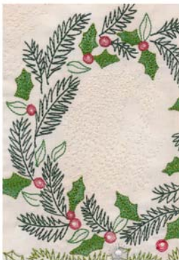
12592-05 Tile 5 4.80 X 6.70 in. 121.92 X 170.18 mm 15,950 St. L