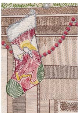
12592-09 Tile 9 4.87 X 6.79 in. 123.70 X 172.47 mm 18,131 St. L