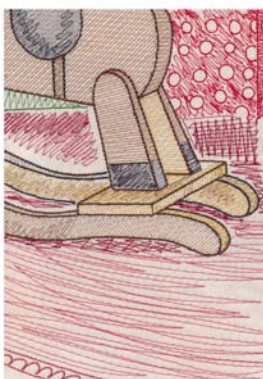
12592-21 Tile 21 4.94 X 6.70 in. 125.48 X 170.18 mm 12,666 St. ⌘ ⊗ L