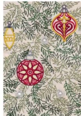
12592-07 Tile 7 4.77 X 6.68 in. 121.16 X 169.67 mm 32,236 St. L