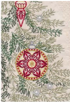
12592-13 Tile 13 4.78 X 7.04 in. 121.41 X 178.82 mm 28,179 St. ⌘ ⊗ L

Note: Some designs in this collection may have been created using unique special stitches and/or techniques. To preserve design integrity when rescaling or rotating designs in your software, always rescale or rotate designs using the handles directly on-screen.