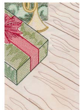
12592-24 Tile 24 4.70 X 6.71 in. 119.38 X 170.43 mm 9,812 St. ⌘ ⊗ L