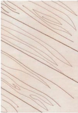
12592-25 Tile 25

Note: Some designs in this collection may have been created using unique special stitches and/or techniques. To preserve design integrity when rescaling or rotating designs in your software, always rescale or rotate designs using the handles directly on-screen.