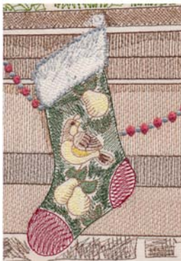
12592-10 Tile 10 4.87 X 6.65 in. 123.70 X 168.91 mm 18,374 St. L