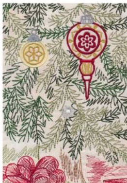
12592-17 Tile 17 4.76 X 6.67 in. 120.90 X 169.42 mm 28,932 St. ⌘ ⊗ L