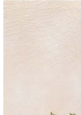
12592-03 Tile 3 5.05 X 6.65 in. 128.27 X 168.91 mm 2,500 St. L