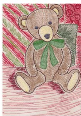
12592-22 Tile 22 4.81 X 6.71 in. 122.17 X 170.43 mm 15,688 St. ⌘ ⊗ L