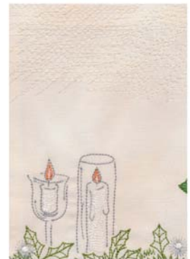
12592-04 Tile 4 5.02 X 6.78 in. 127.51 X 172.21 mm 5,566 St. L