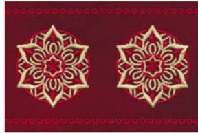
12592-26 Top & Bottom Borders

4.72 X 6.68 in. 119.89 X 169.67 mm 3,099 St. ⌘ L