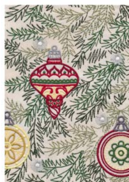
12592-11 Tile 11 4.64 X 6.67 in. 117.86 X 169.42 mm 32,680 St. L