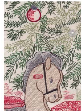
12592-16 Tile 16 4.73 X 6.68 in. 120.14 X 169.67 mm 24,159 St. ⌘ ⊗ L