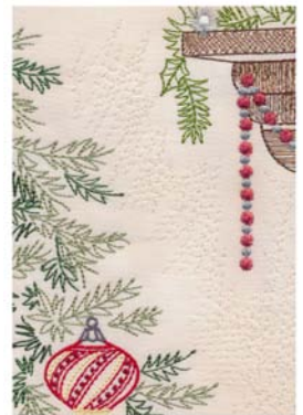
12592-08 Tile 8 4.70 X 6.71 in. 119.38 X 170.43 mm 14,718 St. L